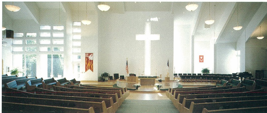
Generous windows fill the sanctuary with natural light and frame views of the wooded site.